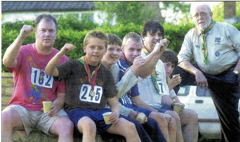
Feeling of triumph after finishing the race – Bourne 1st Scout group enjoy a well earned rest