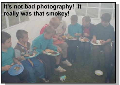
It's not bad photography! It really was that smokey!

For the first "Group Camp" in recent history, Beavers, Cubs and Scouts from Long Sutton spent a weekend at Wolferton Campsite near Sandringham in Norfolk.